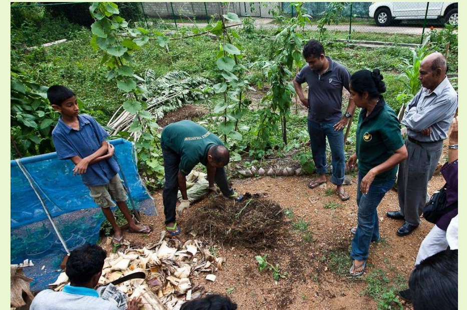
Metta Garden in Colombo, Sri Lanka