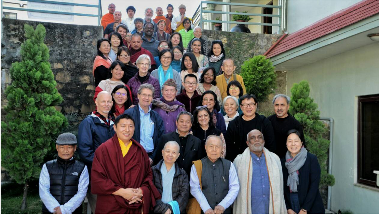
INEB AC/EC Meeting in Nepal, 2018