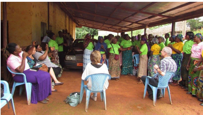
Photo: Partner visit to WFBM in Bambalang. N. W Prgion.

The NWSW regions, particularly areas such as Bamenda, Mendankwe, Mbouda, Bafoussam and Dschage continue to experience extensive armed violence. Civilians face major risks such as kidnapping, rape, sexual harassment, blackmail, property damage and ambushes. They find themselves caught among the Amba group, which targets them for financial support as well as for retaliation and criminal activities. The military is suspicious of civilians collaborating with armed groups and responds with reprisals, including burning homes after attacks. The prevailing insecurity and complexity of the situation contributes to the settling of scores and attracts opportunistic individuals who exploit the crisis for personal gain through blackmail and corruption.