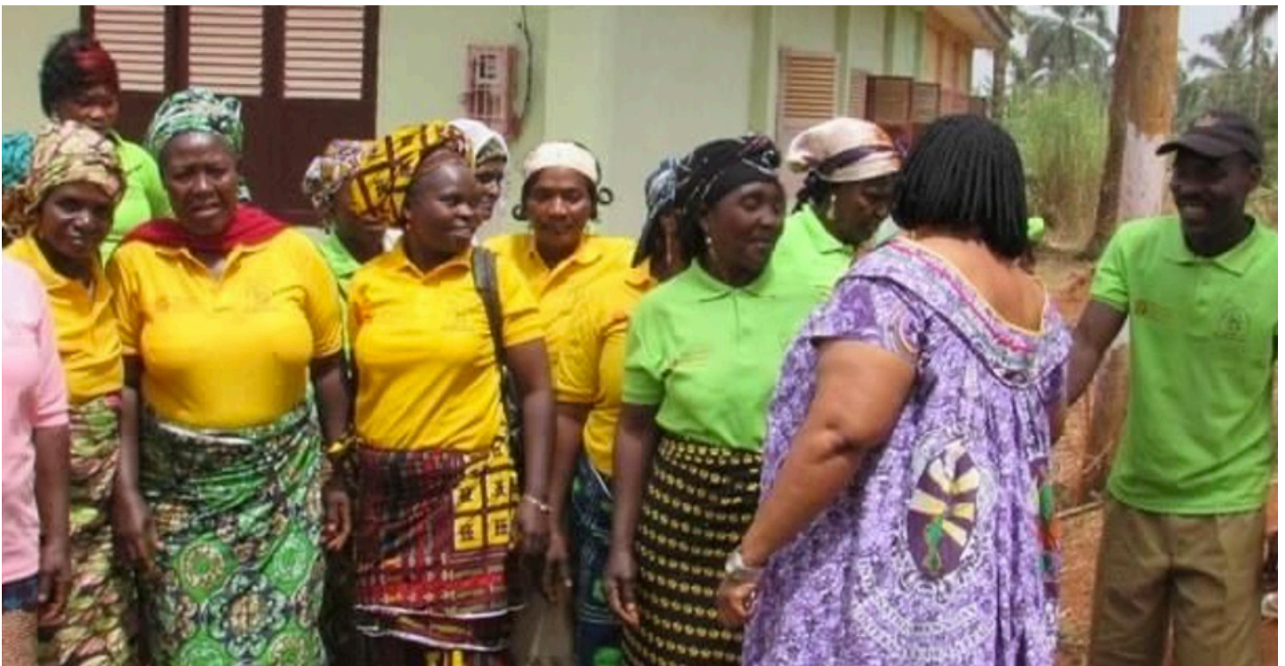
Photo: Celebrating International Women's Day in Balikumbat with WFBM.

This case study draws on observations from interviews conducted in 2023 with WFBMs across Cameroon. It is against this background that this WFBM report explores firsthand the challenges, entry points, risks, strategies and specific support of women faith-based mediators in North-West and South-West Cameroon.