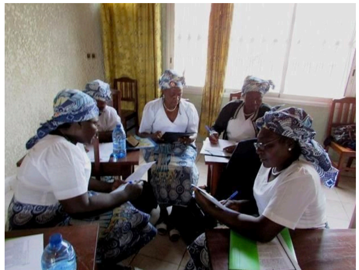
Photo: Group work with Catholic Women Organization as Faith Mediators in Bamenda 2018.

For young people and in particular young women, it is generally difficult to have a role in the Cameroonian society, when the role is related to decision-making power, residing with men or elder women. 27 While youth are at the forefront of the conflict, they are generally not included in mediation or peace efforts. 'If it is about making decisions, the youth are seen to be the problem, and are not given the chance to make proposition to solve the problems.' 28 Young women, often considered below the age 35, are not heard and often not included. 29