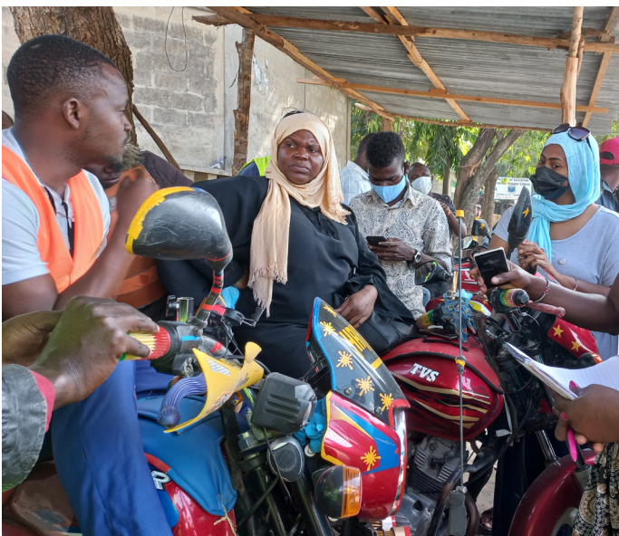
Photo: Maskani visit by the Mombasa Women of Faith Network in Mombasa, Kenya, to advocate for peaceful co-existence in October, 2022.