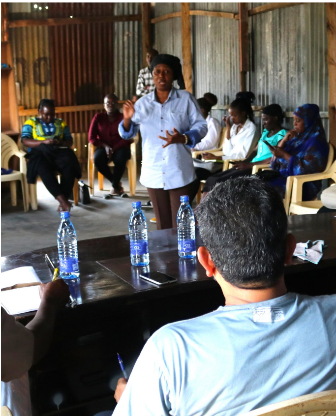
Photo: Members of the Embakasi Women of Faith Network during an anti-sexual gender-based violence experience sharing workshop.

Kenyan society is faced with a myriad of challenges, especially on matters of peace, development, and cohesion. As a result, there is a dire need for different actors to contribute towards a society that is less violently motivated. Women faith-based mediators are actively on the frontline advocating for a just, peaceful, equitable, and inclusive society on all fronts. The use of faith as the armour in this battle is a source of motivation. 35 They have leveraged their faith identity to engage communities and have forged alliances with other institutions to shape and engage in mediation. They are influential because of their faith identity and due to the trust that they have earned due to active participation in community matters. However, the efforts and potential of WFBMs are yet to be fully recognized.