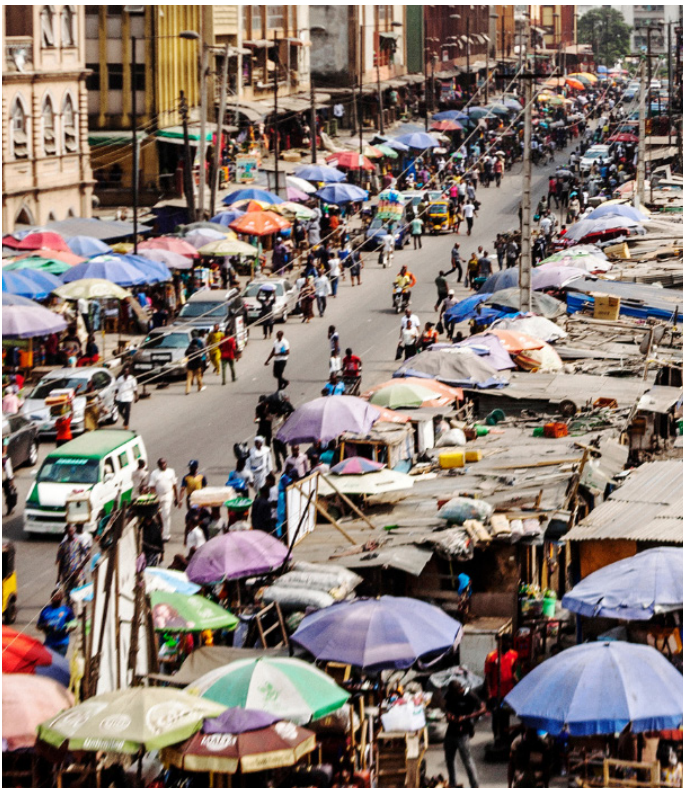
Photo: Lagos, Nigeria.

Like every field of human endeavor, WFBMs are equally encumbered by several challenges and risks. One significant obstacle is the patriarchal structures within society, where discrimination based on traditional norms, gender stereotypes and religious and cultural practices hinders the participation of women in community activities and leadership roles. Religious leadership also poses a significant challenge, leading to discrimination within male-dominated religious leadership structures, especially as the acceptability of women in religious leadership structures is limited.