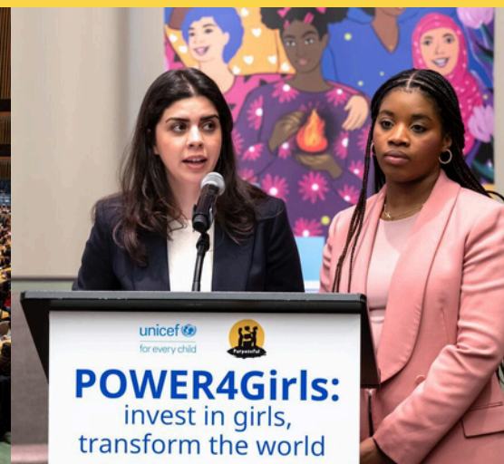
POWER4Girls event during CSW69/Beijing+30. 2025.