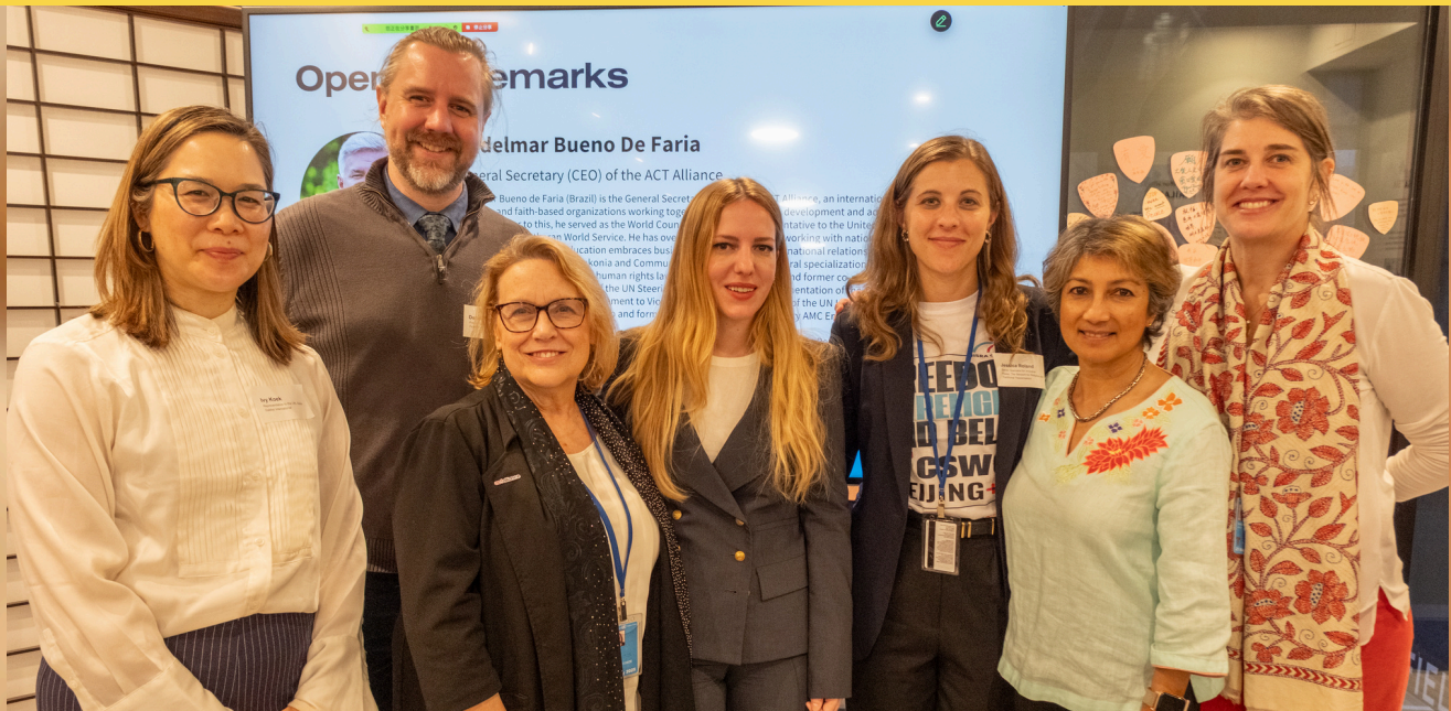
Members of the MFAC Gender Working Group. 2025.

This brief draws on research conducted by the United Nations Multi-Faith Advisory Council (MFAC) Gender Working Group. It aims to promote dialogue and strengthen partnerships between the UN and FBOs by sharing-evidence and practical guidance on how faith can positively contribute to advancing gender equality. The MFAC was convened by the UN Inter-Agency Taskforce on Religion and Sustainable Development (IATF-Religion) in September 2018 as an informal and voluntary entity, currently composed of 36 UN system accredited faith-based partners, reflecting the diversity of religious expressions with representation from around the world.