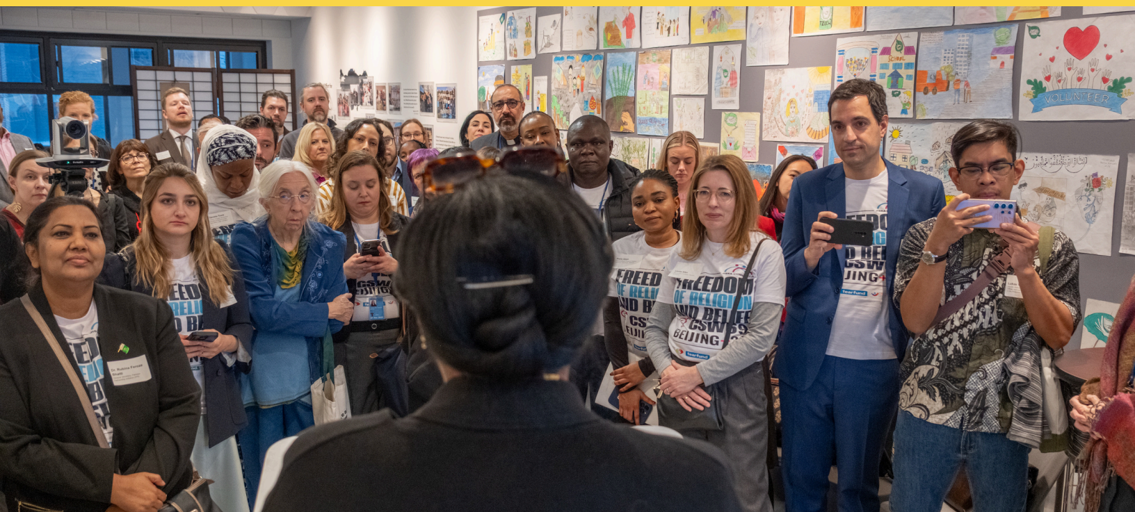
MFAC CSW69 Reception. 2025.

This brief is both a resource and a call: to strengthen multilateral efforts through values-based collaboration and shared commitments to human dignity, equality and justice. It encourages reclaiming a collective prophetic voice , one that resists distortion, affirms equality, and land promotes inclusion.